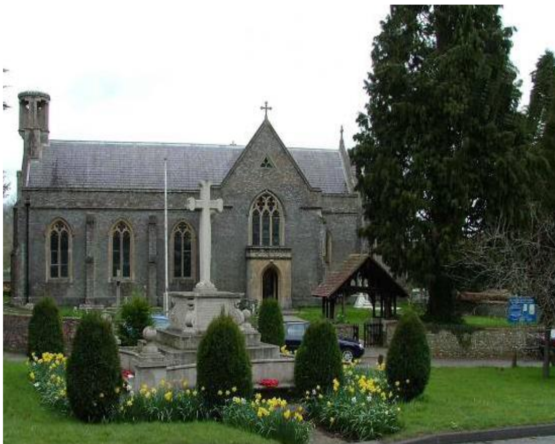
St. Matthew's Church, Otterbourne